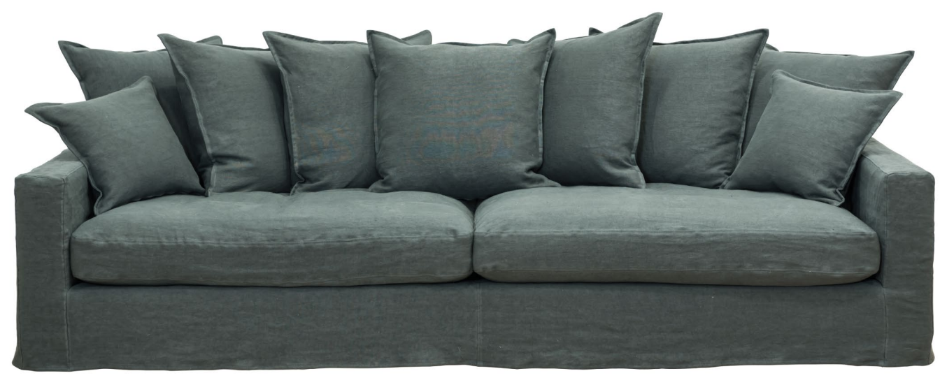
LINO 11231-28 DARK SLATE