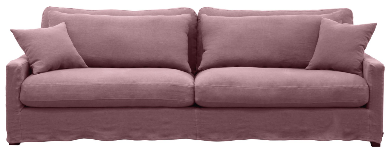
LINO 11231-54 COGNAC